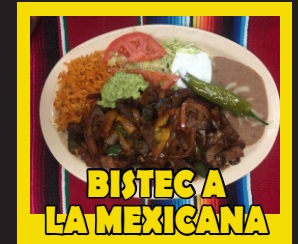
BISTEC A LA MEXICANA