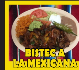
BISTEC A LA MEXICANA